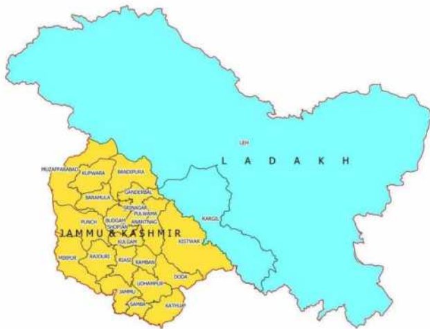
Figure 2 Map of Jammu and Kashmir